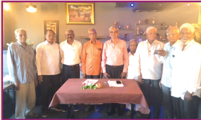
Working Committee elected at AGM, Bhusaval held on 13.04.2023