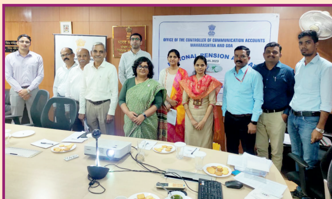
GS & AGS at Pension Adalat Conducted by CCA Maharashtra held on 17.05.2023