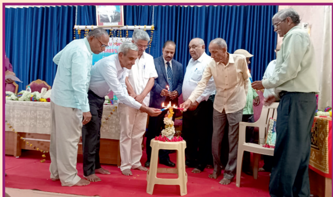
Lightening Lamp at Inauguration of AGM at Dharwad held on 21.05.2023