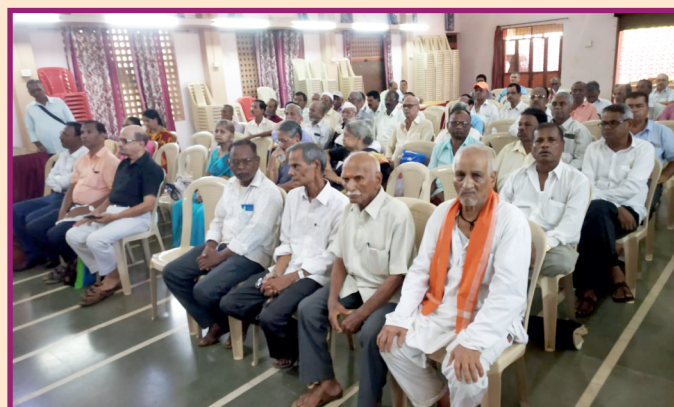
View of Audience at AGM Ratnagiri held on 08.06.2023