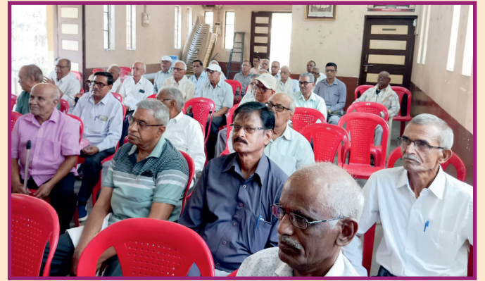
View of Audience at AGM, Jalgaon held on 12.04.2023