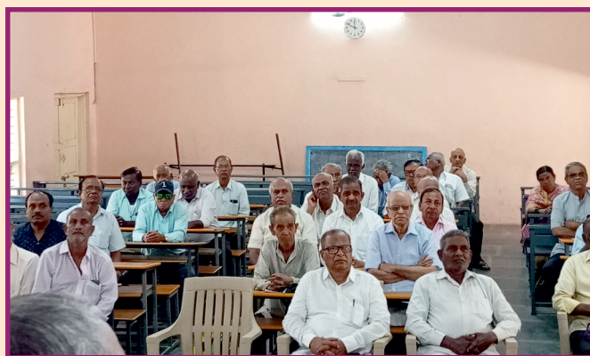
View of Audience at AGM Dharwad held on 21.05.2023