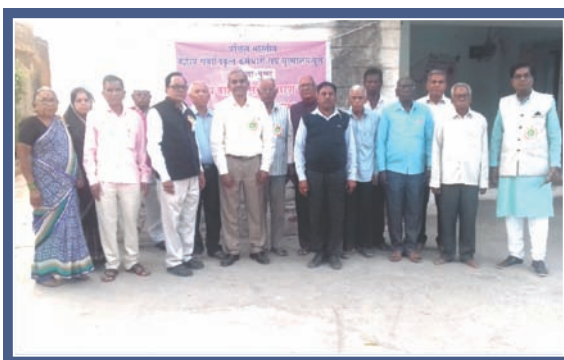
New Executive Body of Pusad Branch Elected on 03.02.2019