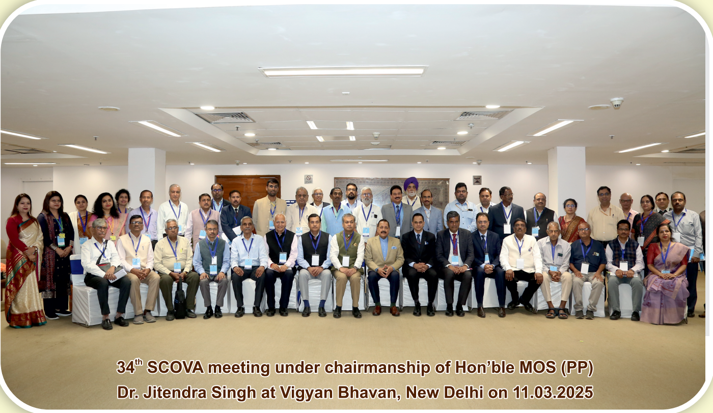
34 th SCOVA meeting under chairmanship of Hon'ble MOS (PP) Dr. Jitendra Singh at Vigyan Bhavan, New Delhi on 11.03.2025