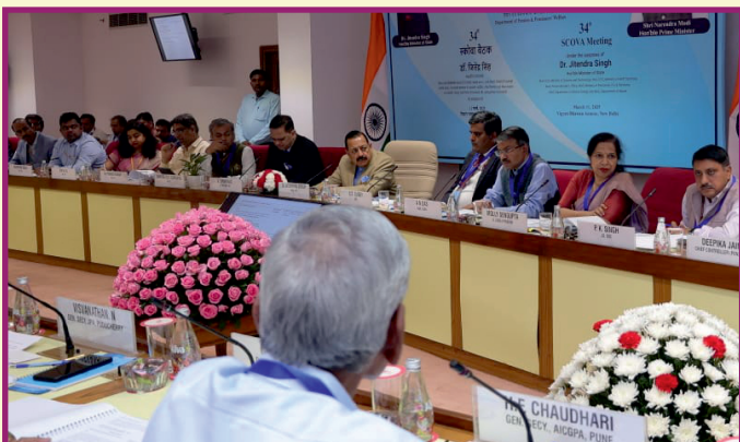
34th SCOVA Meeting held under Chairmanship of Hon'ble Minister Shri Jitendra Singh on 11.03.2025