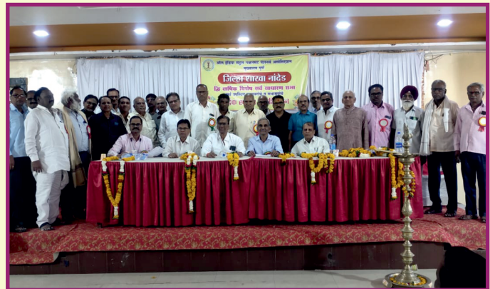
Working Committee elected at AGM Nanded District Branch held on 08.03.2025