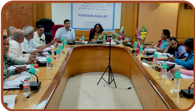
View Pension Adalat under chairmanship of CCA, Maharashtra at Pune on 25.03.2025