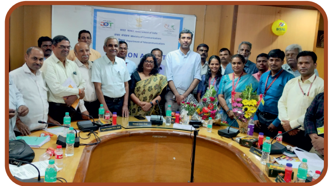
Group photo of Officers of CCA, Maharashtra with Office bearers of PWAs at meeting held on 25.03.2025.