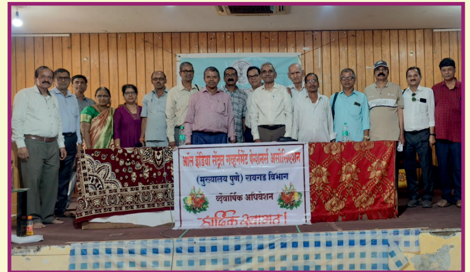
Working Committee elected at the AGM Raigad Distict branch held on 28.02.2025