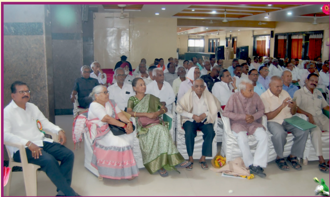
View of Audience at AGM Nanded District Branch held on 08.03.2025