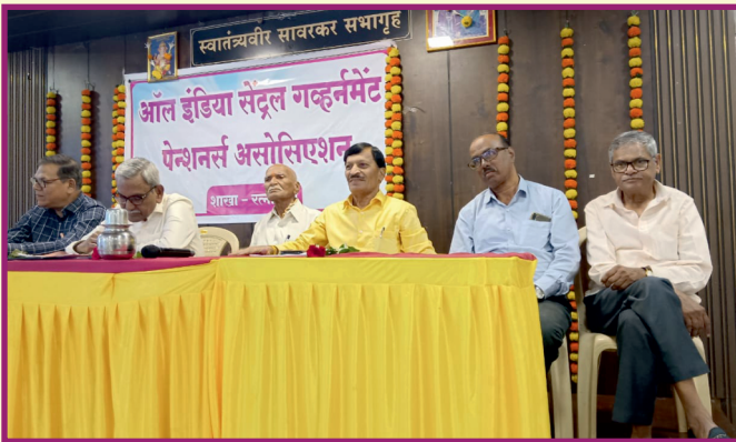
Dignitaries at Dias at Pensioners Anand Mela at Chiplun held on 06.02.2025