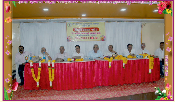
Dignitaries on the Dias at AGM Nanded District Branch held on 08.03.2025