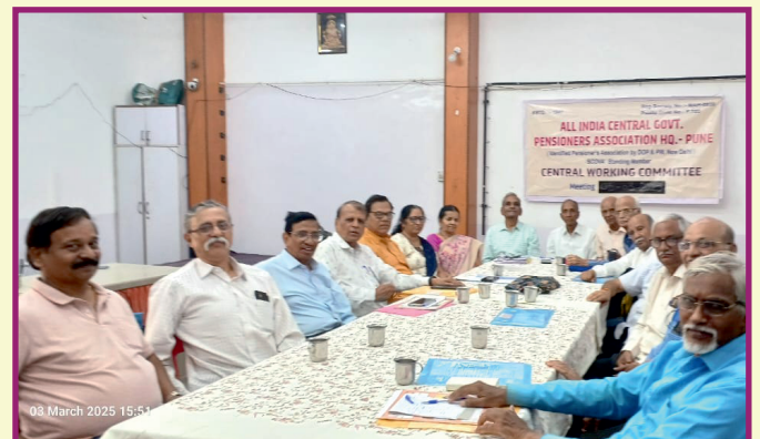
View of CWC Members at Meeting held at Pune on 03.03.2025