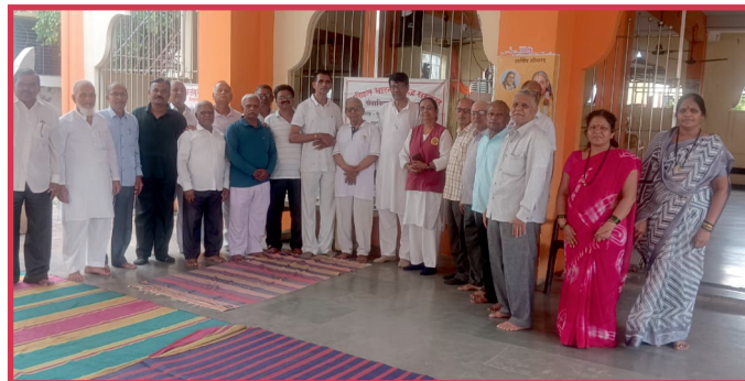
Yoga Day was observed by AICGPA Chalisgaon Branch on 21.06.2025.