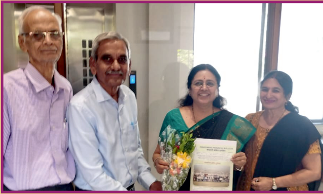
Dr. Medha Kulkarni, Hon'ble MP was handed over memorandum of CGHS Center at Kothrud Pune.