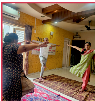
Yoga Day was observed by AICGPA Hq. Pune on 21.06.2025