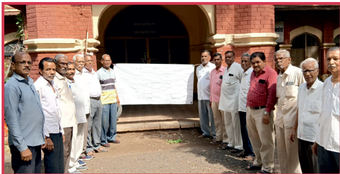
Yoga Day was observed by AICGPA Akola Branch on 21.06.2025