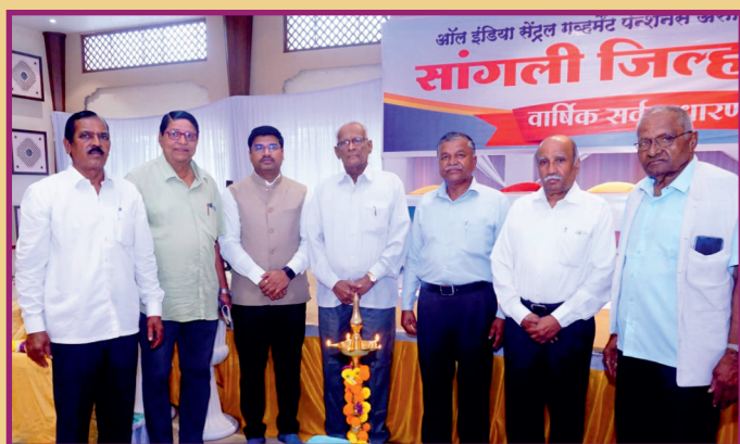
Deep prajwalan at AGM, Sangli held on 13.06.2025.