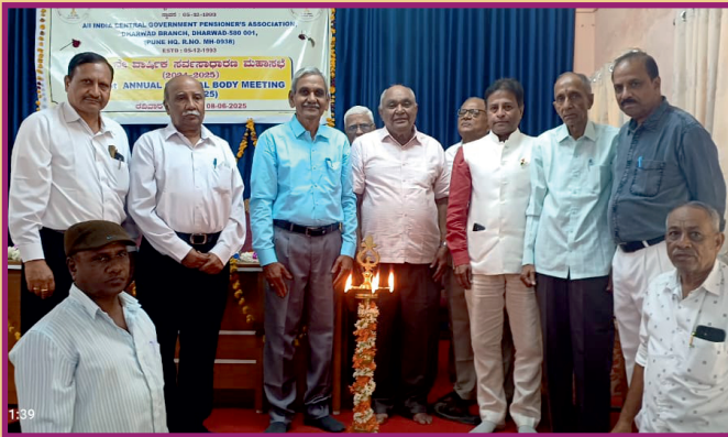
Lightening the Lamp at AGM, Dharwad held on 8.06.2025