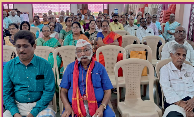
View of Audience at AGM Ratnagiri held on 11.06.2025