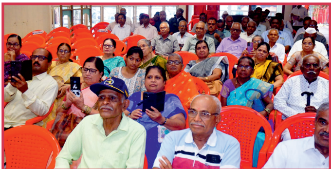
View of Mass gathering at AGM, Sangli held on 13.06.2025.