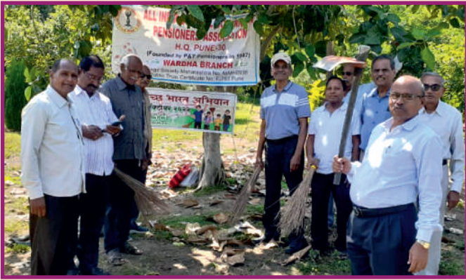
Swachhata Abhiyan at Mukhtangan, Wardha on 2.10.2022