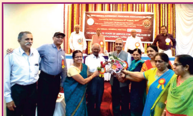
Management Team was honoured with Boukay at 70th AGM held at Pune on 12.10.2022