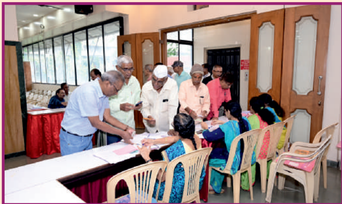
Reception and registration of delegates at 70 th AGM held at Pune on 12.10.2022