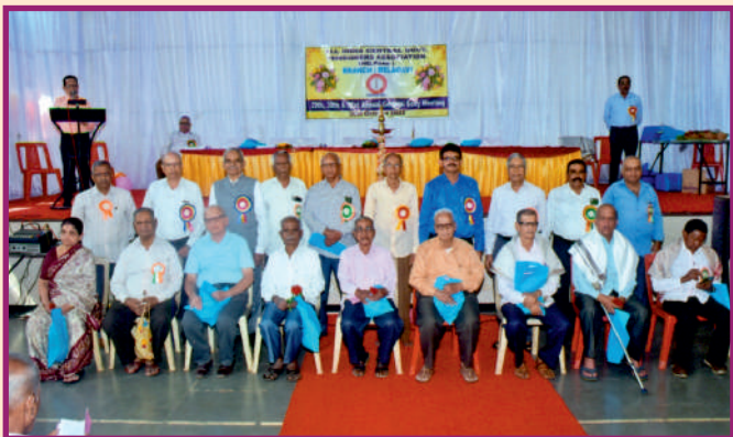
Senior Members (80years) were honoured at AGM, Belagavi held on 30.10.2022