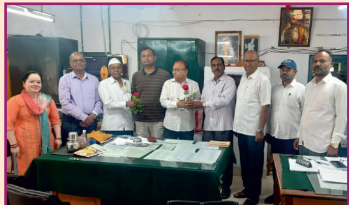
Pensioners Day was celebrated at Sangli on 17.12.2022