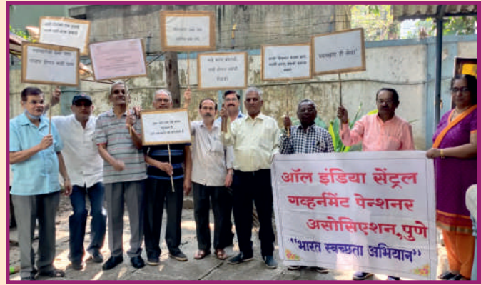
Swachhata Abhiyan at Tiffin Shade at Telephone Bhavan, Pune on 27.10.2022