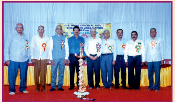
Lightening the lamp at AGM, Belagavi held on 30.10.2022