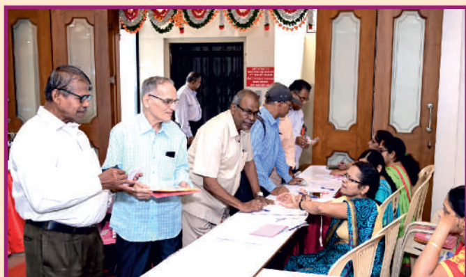
Reception and registration of delegates at 70th AGM held at Pune on 12.10.2022