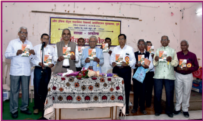
Publishing 'Pensioners Telephone Directory 2022' at AGM, Akola held on 15.10.2022