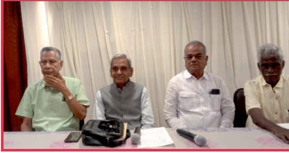
Executive Body Meeting of Coimbatore Br. attended by G. S. On 15.12.2022

Posted on 07.01. 2023 at BPC, Vishrambaugwada, Pune-30