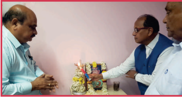
Pensioners Day was celebrated at Dharwad on 17.12.2022