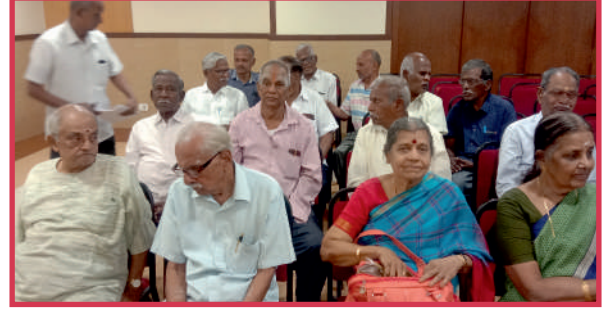
Members present at Executive Body Meeting of Coimbatore Br. Held on 15.12.2022