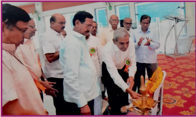
Lightening the lamp at AGM, Wardha held on 3.10.2022