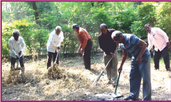
Swachhata Abhiyan conducted at CTO, Compound Akola on 29.10.2022